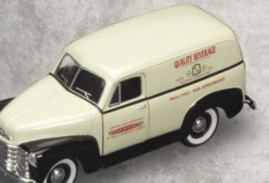
1952 Chevy Panel Die-cast bank • Opening doors & rear door

Street Rod Delivery Die-cast bank • Opening rear door