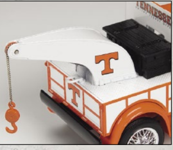
Tow Truck / Wrecker