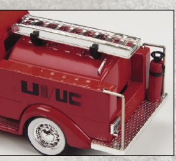
Tanker / Fire Pumper